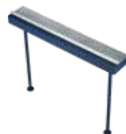
Right Extension with gauge Left Extension without gauge