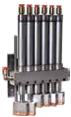
Up to 6 cylinders vertical clamping extension kit