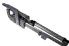
Pneumatic horizontal clamp of moldings