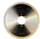
Special blades for wood or for aluminum