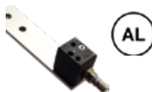
Mist spray cooling system for aluminum cuts